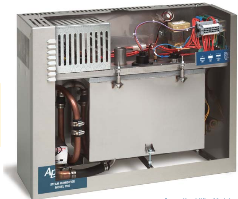
Steam Humidifier Model 1160

Whenever you have an application that needs humidity, remember Aprilaire has both the product and knowledge you need to make every job a success. Call our tech support group at 1-800-334-6011 and we can guide you through. n