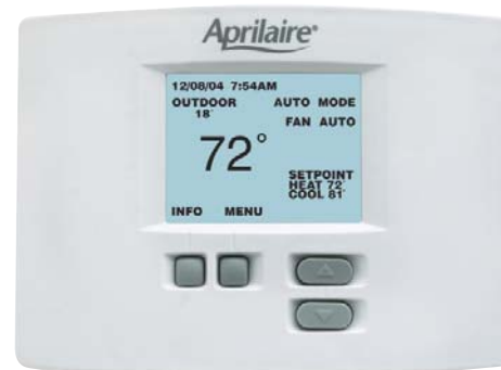
Aprilaire® Model 8570

Your customer can get by just fine with the $30 thermostat also. It will heat or cool the house. But, considering that it is the only