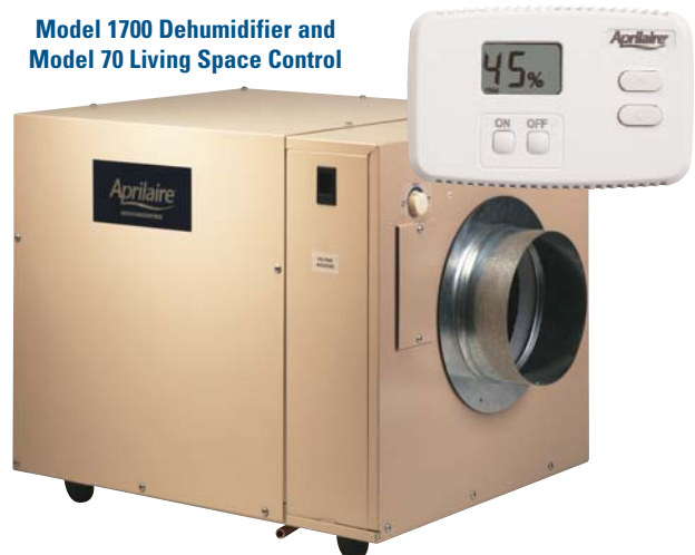
Model 1700 Dehumidifier and Model 70 Living Space Control

Complete instructions are available at www.aprilairecontractor.com or from your Aprilaire District Sales Manager. n