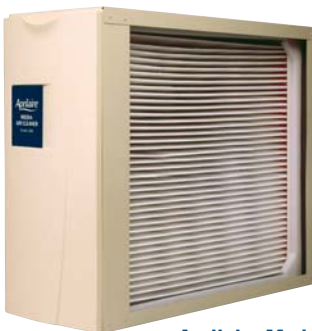
Aprilaire Model 2200 Whole-Home Air Cleaner

When you are quoting a system replacement, this is the one time when you can be sure the homeowner is interested in hearing about whole-home air cleaners.