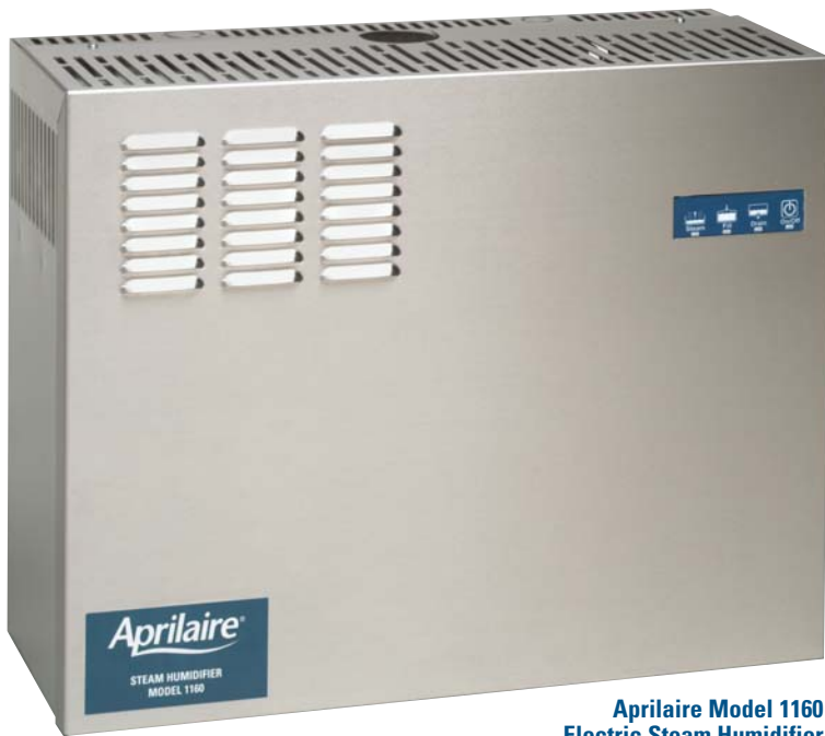
Aprilaire Model 1160 Electric Steam Humidifier